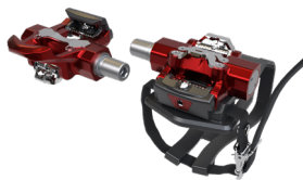
Morse Taper Triple Link™ Delta-compatible pedals