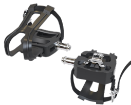
Standard Morse Taper Double Link™ pedals